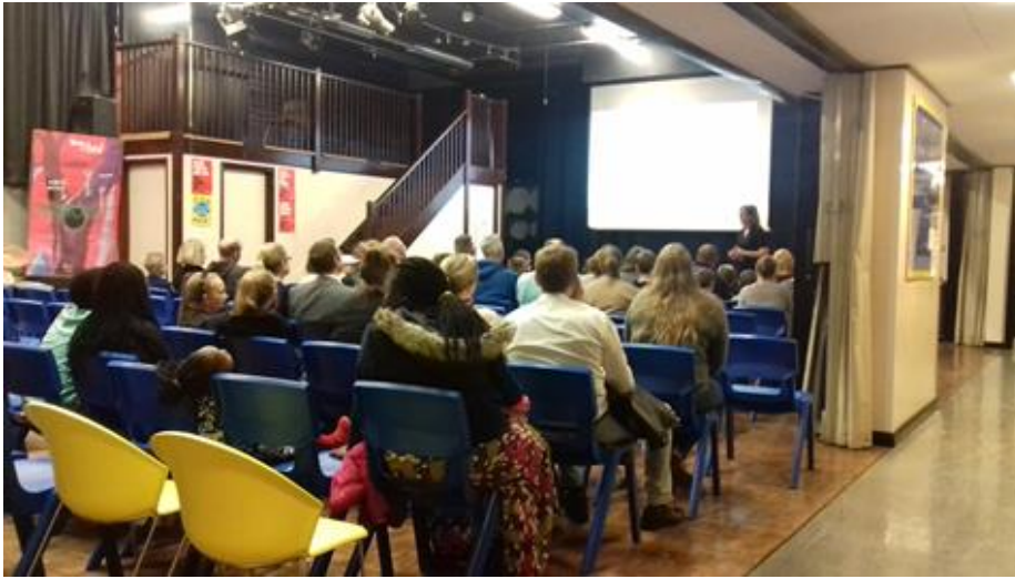
OPEN EVENING 2017